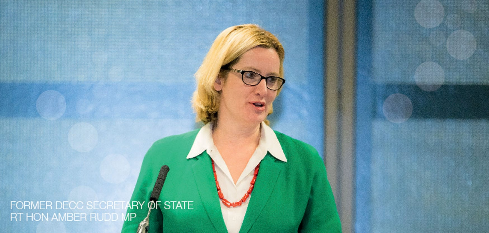
FORMER DECC SECRETARY OF STATE RT HON AMBER RUDD MP