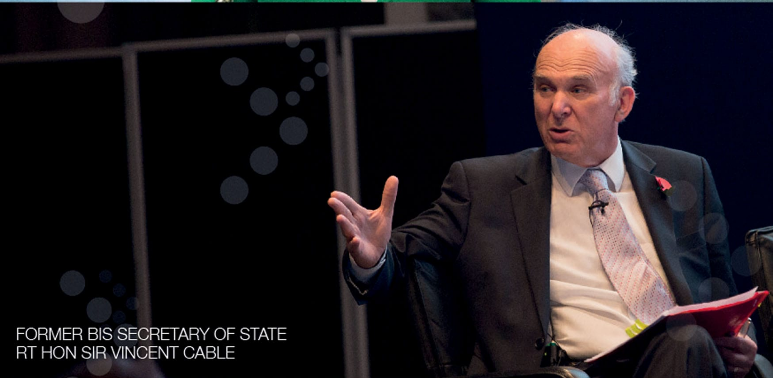
FORMER BIS SECRETARY OF STATE RT HON SIR VINCENT CABLE